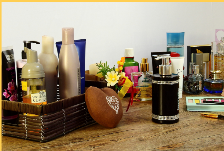
Personal care products