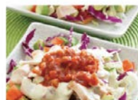
Fish Taco Salad