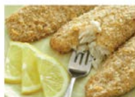
Crispy Parmesan Baked Fish