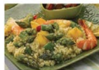
Grilled Asparagus and Shrimp Quinoa Salad with Lemon Vinaigrette