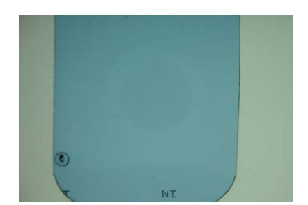
Figure 2 – Passing Fog Test