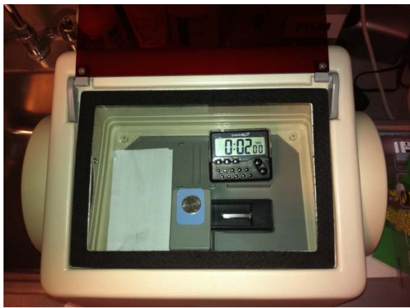
Figure 1 – Intraoral Fog Test Set-up in a Glove box