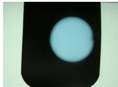
Figure 2 – Failing Fog Test