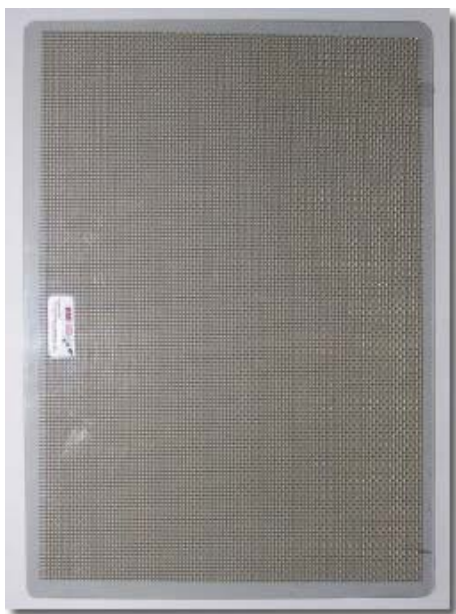
What the test tool looks like...