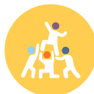
Supportive Schools and Communities