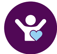
Adults Who Understand