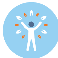
Physical and Mental Health