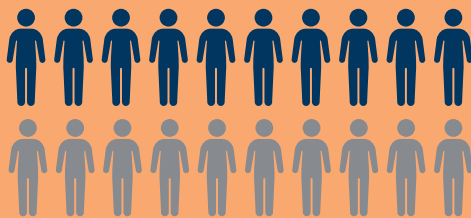
Student participation on sports teams 2