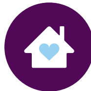
Families and Caregivers