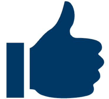
And much more!