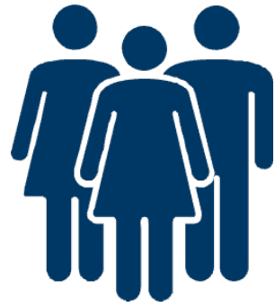
Race and ethnicity